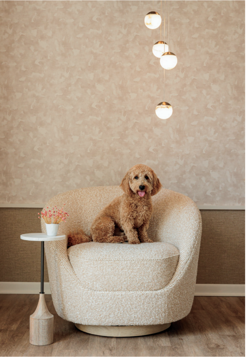
HIKARU - HIMALAYAN SALT, CHATEAU - QUAIL, CHORD - CHEESECAKE

Like a song on repeat, the Brentano Design Studio's latest collection is a compilation of patterns and textures that bring to life their hearts' desire.