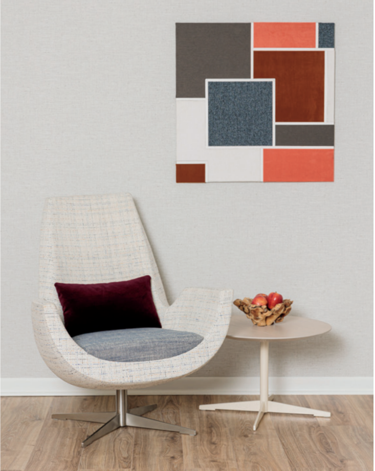
CHATEAU - WHITE SEASHELL, EXPRESSION - SNOWMAN, NOTES - BLUEPRINT, GEM - GARNET

EXPRESSION - BEACH DAY PHOENIX - CROUTON, PLAYGROUND - CRAYON BOX, LAELJA - ATLAS MOTH, ARCHIE GOLDEN ROPE, CLEMENT - FARRO, REVERE - TOASTED PECAN