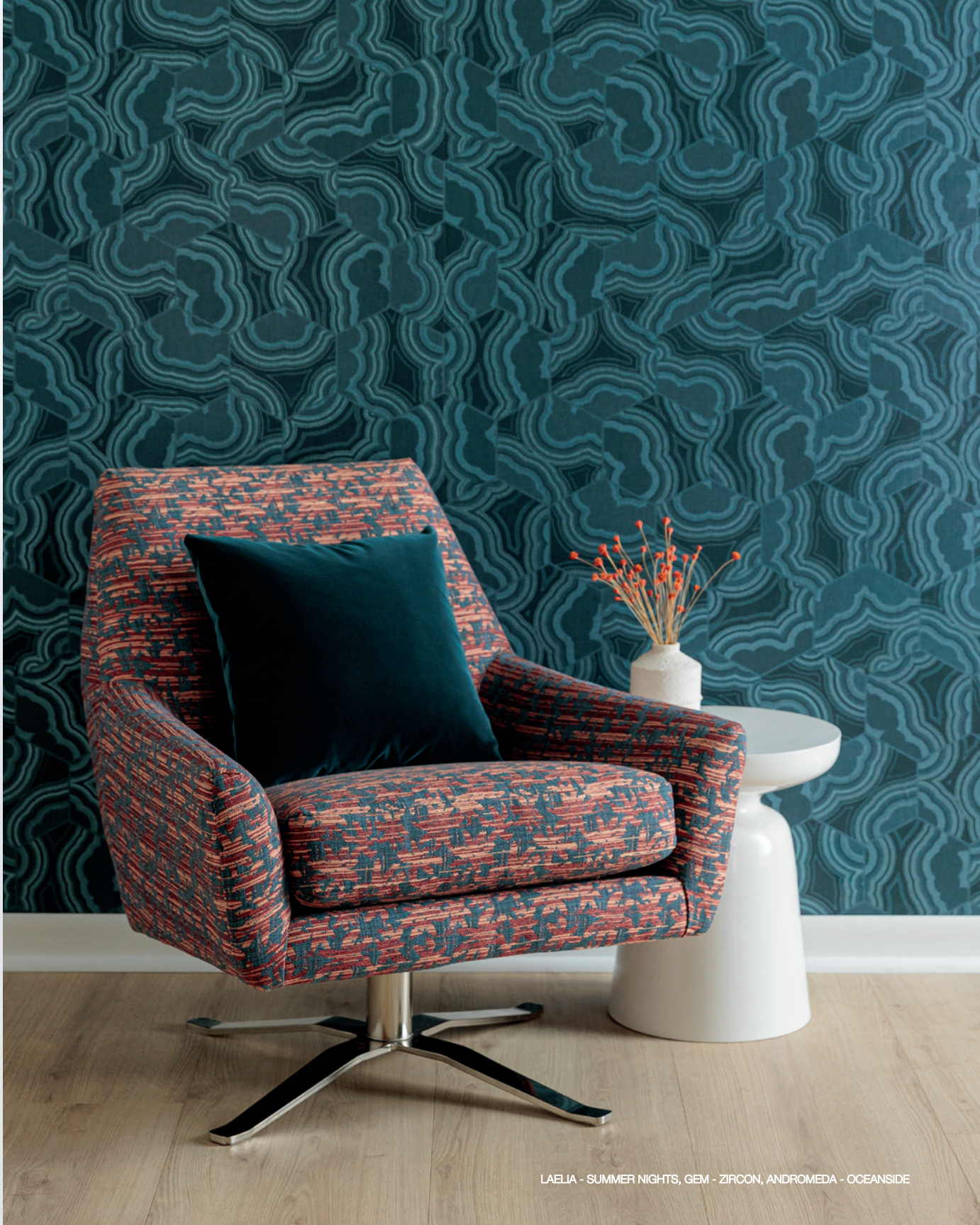
LAELIA - SUMMER NIGHTS, GEM - ZIRCON, ANDROMEDA - OCEANSIDE