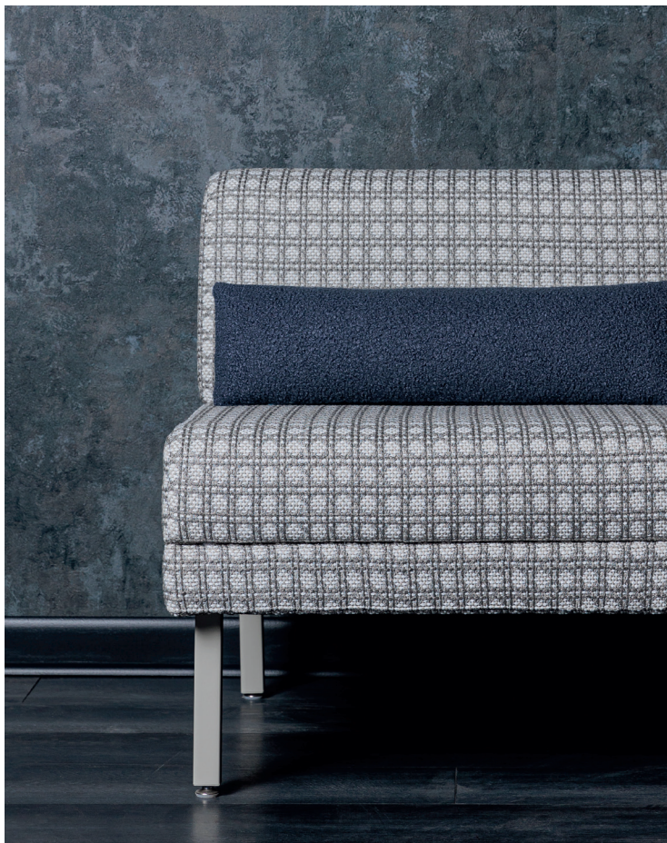
V111-09 LONA - BLACK LAVA, 1345-01 FILBERT - PALETTE KNIFE, 7303-16 HUDDLE - CHARCOAL BLUE

The Brentano Design Studio, led by Iris Wang, has grown from a modest eight patterns in 1990, into an international source for residential, hospitality and commercial fabrics and wallcoverings. The range has expanded to include luxurious vegan leathers, sophisticated indoor/outdoor choices, dynamic stain resistant and easy clean finish options, as well as a beautiful collection of eco-friendly textiles.