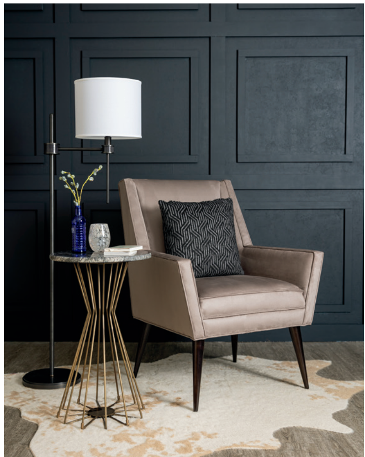
PHOTOGRAPH: VERSAILLES, CIRRUS

The Brentano Design Studio, led by Iris Wang, has grown from a modest eight patterns in 1990, into an international source for residential, hospitality and commercial fabrics and wallcoverings. The range has expanded to include luxurious vegan leathers, sophisticated indoor/outdoor choices, dynamic stain resistant and easy clean finish options, as well as a beautiful collection of eco-friendly textiles.