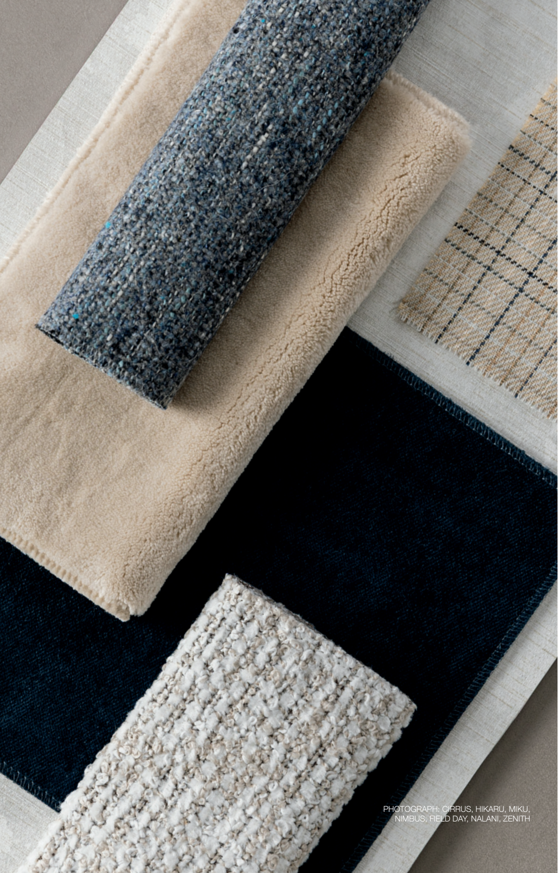
PHOTOGRAPH: CIRRUS, HIKARU, MIKU, NIMBUS, FIELD DAY, NALANI, ZENITH