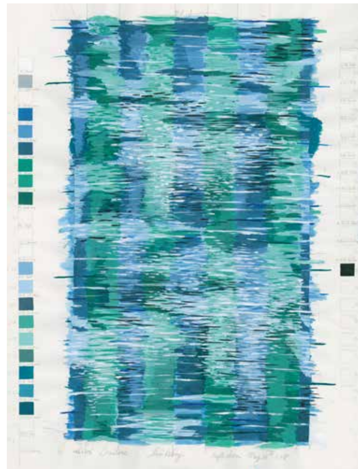
FONTAINE ORIGINAL ARTWORK

The Brentano Design studio, led by Iris Wang, has grown from a modest eight patterns in 1990, into an international source for residential, hospitality and commercial, upholstery and drapery fabrics. The range has expanded to include luxurious faux leathers, sophisticated indoor/outdoor choices, dynamic stain resistant and easy clean finish options, as well as a beautiful collection of eco-friendly textiles.