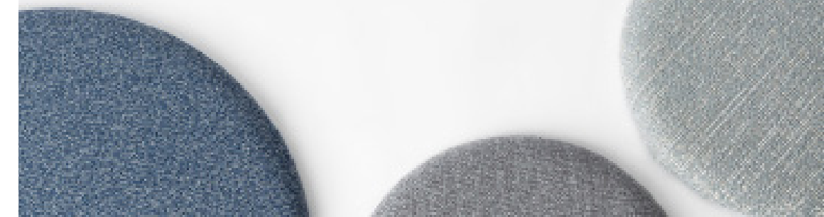
PHOTOGRAPH: INTUITION, TUNE, FUSE

Framework truly reflects collaboration on every level, culminating in a collection that is the epitome of restrained modern style.