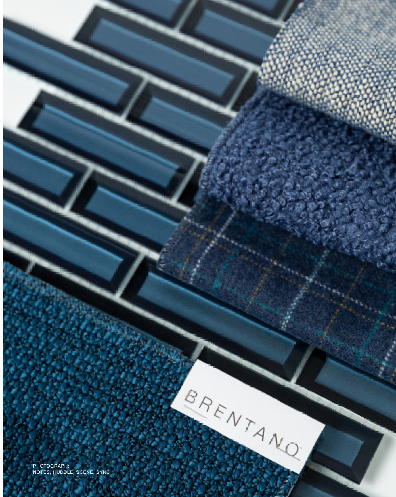
PHOTOGRAPH: NOTES, HUDDLE, SCENE, SYNC