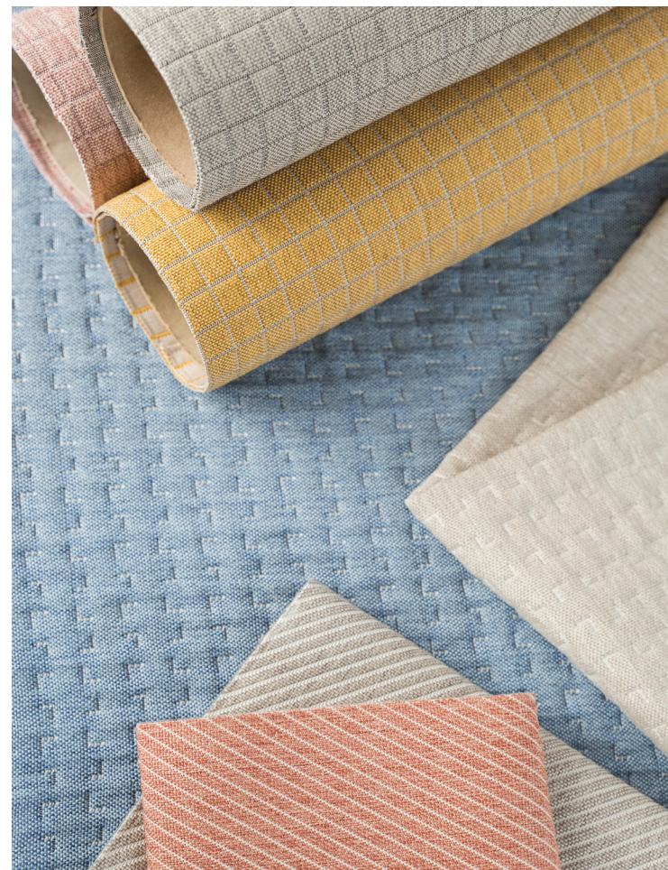
PHOTOGRAPH: QUERY, PLOT, SEQUENCE

The Brentano Design Studio, led by Iris Wang, has grown from a modest eight patterns in 1990, into an international source for residential, hospitality and commercial fabrics for both upholstery and drapery. The range has expanded to include luxurious vegan leathers, sophisticated indoor/outdoor choices, dynamic stain resistant and easy clean finish options, as well as a beautiful collection of eco-friendly textiles.